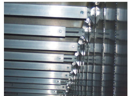
Reduces cargo damage by using recessed fasteners so there are no protruding heads that can snag freight.

GREAT DANE. AHEAD OF THE INDUSTRY. BEHIND YOU ALL THE WAY.