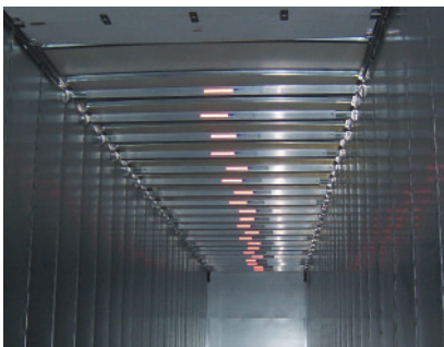
Double Dex's innovative design creates a second deck to help maximize utilization of the trailer.

Great Dane has made significant strides in the manufacturing and performance of trailers. We take pride in developing custom solutions to meet our customers' challenges and needs.