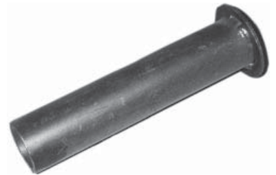
Sand Shoe Axle 8.25"