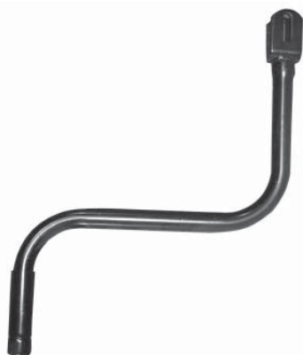
Vertical Crank Handle