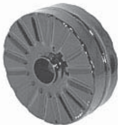
Wheel 9" Diameter