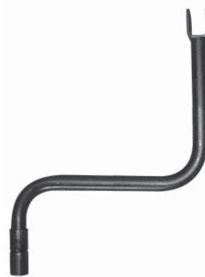
Horizontal Crank Handle