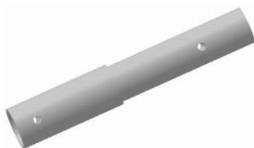
Crank Handle Extension